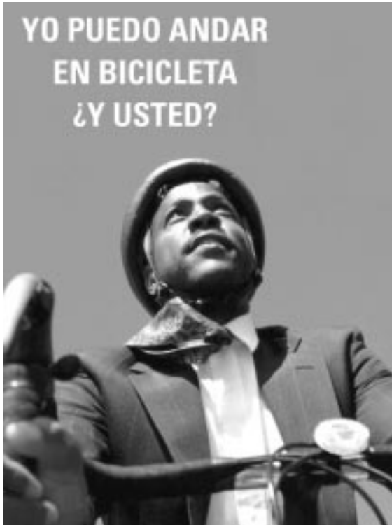
Our favorite poster from the Regional Transportation Commission's "Don't Drive One in Five" campaign.

The Don't Drive One in Five outreach campaign aims to encourage Santa Cruz County residents to leave their cars at home one day out of five, or one trip in five.