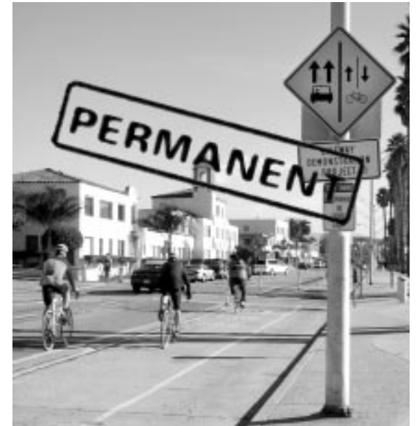
For better or worse, the permanent bike path is not going to look like this one. To check out the latest plan set, contact Cheryl Schmidt at 420-5187.

A pleasurable cycling experience on Beach Street will encourage bikers to ride more often, bring more money to Beach Street businesses, and give beachfront workers a way to get to to work safely without having to drive. This is a victory for all of us—thanks to everyone who supported this effort. We'll see you on the bike path. ■