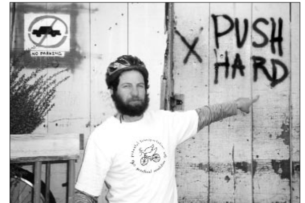
When it comes to political lobbying, People Power has one basic operating principle...

was raised in 1990 through Prop. 116. That money has been earmarked exclusively for running passenger rail service in Santa Cruz County.